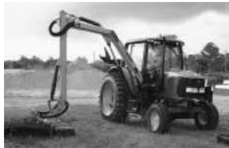
New John Deere 6420 side-arm mower

Landowners are encouraged to call 747-0550 or visit the District's office if they have any questions, concerns, or problems regarding road or drainage issues. Landowners also may visit the District's website at www.sirwcd.org for more information.